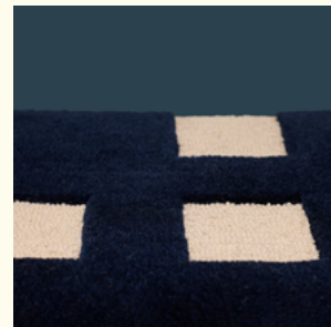
Sea Blue - Cream