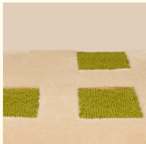
Cream - Green Envy