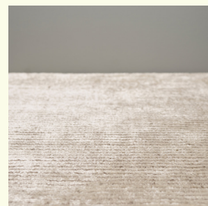
Mist - Brown