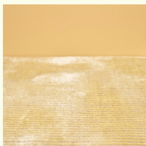
Vanilla - Warm Taupe