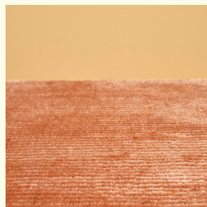
Copper - Deep Orange