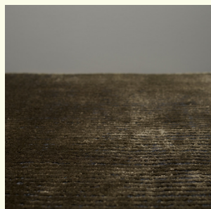
Coffee - Jet Black