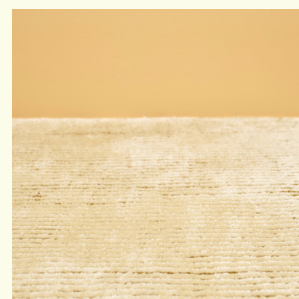
Vanilla - Mustard Brown