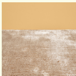
Warm Taupe - Copper