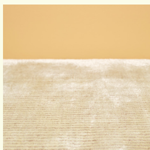
Off Grey - Warm Taupe