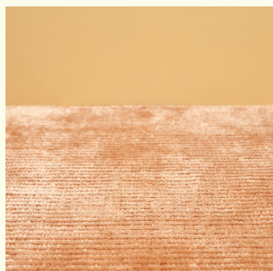
Chalky Brown - Terracotta