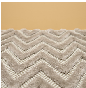
Paloma - Wool Tencel