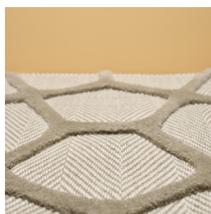
Paloma - Wool Wool