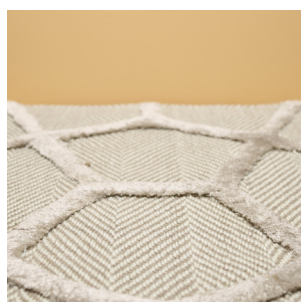
Paloma - Wool Tencel