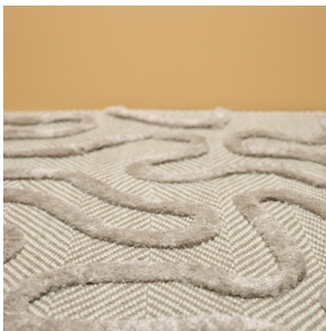
Paloma - Wool Tencel