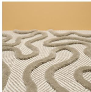
Paloma - Wool Wool