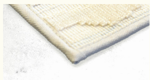
Small cotton border